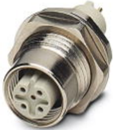
Sensor/Actuator flush-type socket, 5-pos., M12, B-coded, rear/screw mounting with Pg9 thread, with straight solder connection

Please be informed that the data shown in this PDF Document is generated from our Online Catalog. Please find the complete data in the user's documentation. Our General Terms of Use for Downloads are valid ( http://download.phoenixcontact.com )