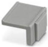
Equipment marker, width 12 mm