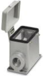
HEAVYCON box mounting base D50 for double locking latch, height 97 mm, with support 1xM25, with cover

Please be informed that the data shown in this PDF Document is generated from our Online Catalog. Please find the complete data in the user's documentation. Our General Terms of Use for Downloads are valid ( http://phoenixcontact.com/download )