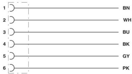
Contact assignment of M8 socket