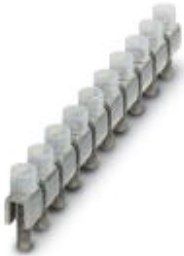
Fixed bridge, pitch: 12 mm, length: 7.5 mm, width: 118.4 mm, number of positions: 10, color: silver

Please be informed that the data shown in this PDF Document is generated from our Online Catalog. Please find the complete data in the user's documentation. Our General Terms of Use for Downloads are valid ( http://phoenixcontact.com/download )