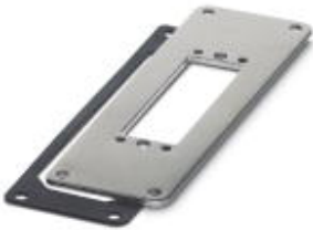
The illustration shows version HC-B 24-ADP-VC-3

Adapter plates 2 mm thick, for panel cutouts of HC-B 24 size, including 1.5 mm flat gasket, size 2