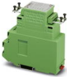
INTERBUS-ST bus terminal module, 24 V DC, with 8-pos. MINI-COMBICON plug, IP20 protection, consisting of: Terminal part with screw connection and module electronics

Please be informed that the data shown in this PDF Document is generated from our Online Catalog. Please find the complete data in the user's documentation. Our General Terms of Use for Downloads are valid ( http://download.phoenixcontact.com )