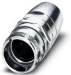
Sleeve housing for coupler connector, straight, Screw locking, M23, Shielded: No, Cable cross section: 3 mm...10 mm

Please be informed that the data shown in this PDF Document is generated from our Online Catalog. Please find the complete data in the user's documentation. Our General Terms of Use for Downloads are valid ( http://download.phoenixcontact.com )