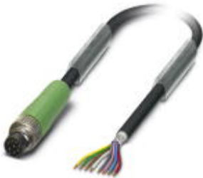
Sensor/Actuator cable, 8-position, PUR, Black RAL 9005, shielded, Plug straight M8, on Free cable end, Cable length: 10 m

Please be informed that the data shown in this PDF Document is generated from our Online Catalog. Please find the complete data in the user's documentation. Our General Terms of Use for Downloads are valid ( http://download.phoenixcontact.com )