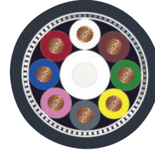
PUR halogen-free black shielded [PUR]