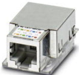
RJ45 socket insert, for the Freenet system, CAT5e, 8-pos., shielded, with cable connection (IDC fast connection), for solid wires AWG 24 ... 22

Please be informed that the data shown in this PDF Document is generated from our Online Catalog. Please find the complete data in the user's documentation. Our General Terms of Use for Downloads are valid ( http://download.phoenixcontact.com )