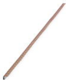
Wiring bridge for modules with connecting pitch 17.5 mm, 1-phase, 57-pos.

Please be informed that the data shown in this PDF Document is generated from our Online Catalog. Please find the complete data in the user's documentation. Our General Terms of Use for Downloads are valid ( http://phoenixcontact.com/download )