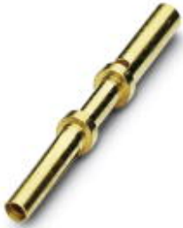
Crimp contact, turned, contact diameter: 0.6 mm, crimp range: 0.14 mm 2 ... 0.34 mm 2

Please be informed that the data shown in this PDF Document is generated from our Online Catalog. Please find the complete data in the user's documentation. Our General Terms of Use for Downloads are valid ( http://phoenixcontact.com/download )