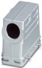
HEAVYCON sleeve housing B16, for double locking latch, height 76 mm, with thread M40, lateral cable outlet, EMC version

Please be informed that the data shown in this PDF Document is generated from our Online Catalog. Please find the complete data in the user's documentation. Our General Terms of Use for Downloads are valid ( http://download.phoenixcontact.com )