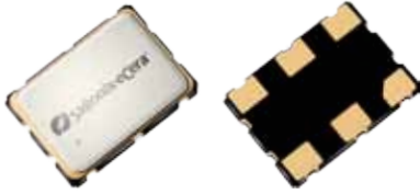
7.0 x 5.0mm Ceramic SMD