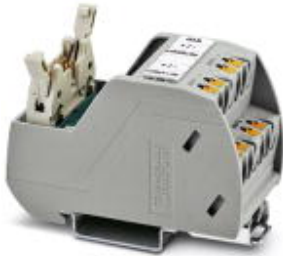
VARIOFACE Professional (VIP) board for the ROC800 controller

Please be informed that the data shown in this PDF Document is generated from our Online Catalog. Please find the complete data in the user's documentation. Our General Terms of Use for Downloads are valid ( http://phoenixcontact.com/download )