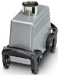
HEAVYCON sleeve housing B16, with double locking latch, height 65 mm, with support 1x M25, straight conductor exit

Please be informed that the data shown in this PDF Document is generated from our Online Catalog. Please find the complete data in the user's documentation. Our General Terms of Use for Downloads are valid ( http://download.phoenixcontact.com )