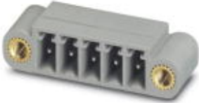
The figure shows the 5-pos. version of the product in gray

Header, Nominal current: 8 A, Rated voltage (III/2): 160 V, Number of positions: 19, Pitch: 3.5 mm, Color: pastel green, Contact surface: Tin, Mounting: Soldering